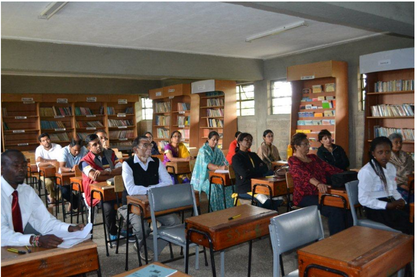
Participants attending the self-review meeting on 30 th APRIL