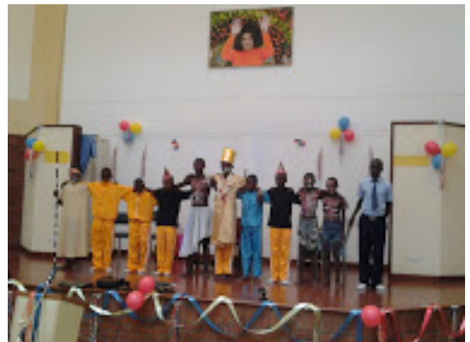
Students performing cultural dances during festival days.